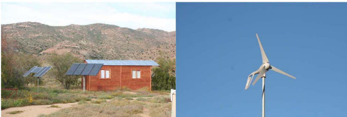
Solar system and wind turbine at the research station.

Power for light and computers is provided by a solar system and a wind turbine. Each room has one power plug. However, power is restricted and you are not allowed to use any devices that use a lot of power like a hair dryer. You can charge your camcorder, camera, toothbrush or cell phone during the day, but not during the night. We have to save energy, especially during cloudy days.